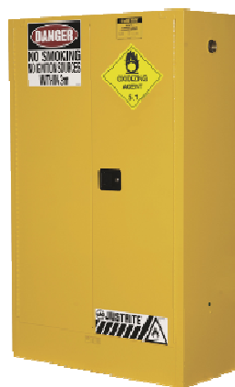
Storage Cabinet CAT.NO. AU25452OA Capacity: 250 Litre / 3 Shelves 9 x 20 Litre Containers

These Cabinets are manufactured for the safe storage of Oxidising Agents. A Safety Shower and Eye/Wash must be installed where packages are opened. Comply with AS 4326 - Class 5.1