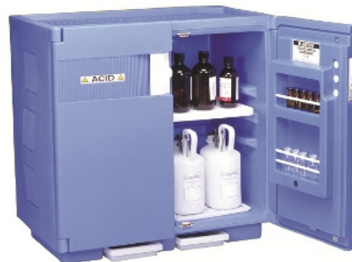
Polyethylene Storage Cabinet CAT.NO. 24160 Capacity: 30 Lt 2 Shelves