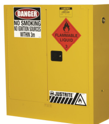
Safety Can Storage CAT.NO. AU25302 160Lt Capacity