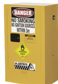
Storage Cabinet CAT.NO. AU25712OA Capacity 60 Lt CAT NO. AU25714OA Capacity 30 Lt Single Door