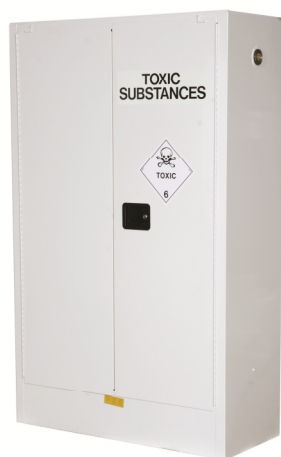
Storage Cabinet CAT.NO. AU25452T Capacity 250 Litre 3 Shelves 9 x 20 Litre Containers

These Cabinets are manufactured for the safe storage of Toxic / Poisons. A Safety Shower and Eye / Wash must be installed where packages are opened. Comply with AS/NZ 4452 - Class 6