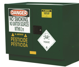
Storage Cabinet CAT.NO. AU25748P Capacity: 100 Litre 2 Shelves