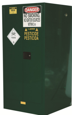
Storage Cabinet CAT.NO. AU25602P Capacity: 350 Litre 3 Shelves 15 x 20 Litre Containers

These Cabinets are manufactured for the safe storage of Pesticides. A Safety Shower and Eye/Wash must be installed where packages are opened.