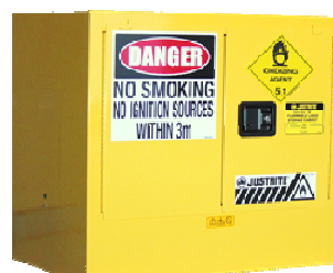
Storage Cabinet CAT.NO. AU25748OA Capacity: 100 Litre / 2 Shelves