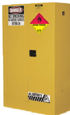
Storage Cabinet CAT.NO. AU25452OP Capacity 100 Litre 3 Shelves

These Cabinets are designed to comply with AS 2714 and have a sump capacity equal to the total of the contents of the Cabinet. They are designed so that in the event of pressure build up the doors will open outwards. The doors are held closed by fiction type mechanism. For this reason the maximum capacity of a Cabinet is 100 kg or 100 L.