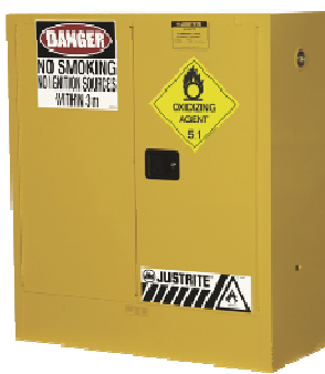
Storage Cabinet CAT.NO. AU25302OA Capacity: 160 Litre / 2 Shelves 6 x 20 Litre Containers