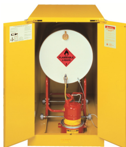
Horizontal Drum Storage CAT.NO. AU25662 207Lt Capacity