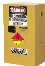
Storage Cabinet CAT.NO. AU25712OP Capacity 50 Lt Single Door