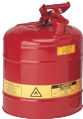
SAFETY STORAGE CANS

Fire protective storage of flammables. Heavy-duty with double-seamed construction. All models have built in flash arresters to eliminate the risk from flashback causing explosion.