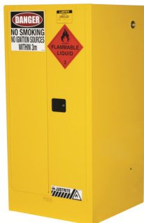
Safety Can Storage CAT.NO. AU25602 350Lt Capacity