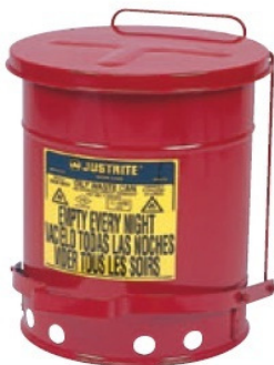
OILY WASTE CANS