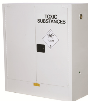
Storage Cabinet CAT.NO. AU25302T Capacity 160 Litre 2 Shelves 6 x 20 Litre Containers