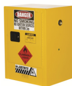
Compac Storage CAT.NO. AU25714 30Lt Capacity