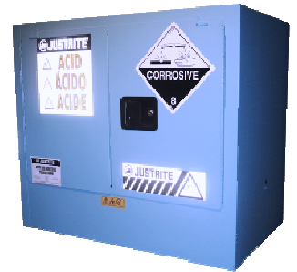
Storage Cabinet CAT.NO. AU25748B Capacity 100 Lt 2 Shelves