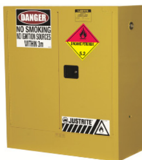
Storage Cabinet CAT.NO. AU25302OP Capacity 80 Litre 2 Shelves