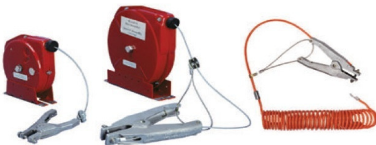
RETRACTABLE STATIC GROUNDING REELS