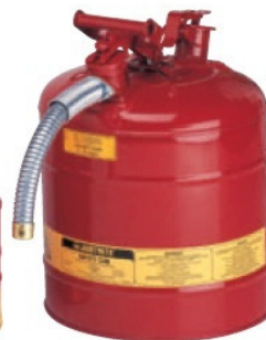
SAFETY DISPENSING CANS