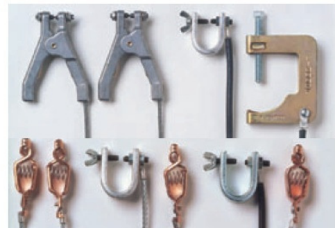
BONDING WIRE ASSEMBLIES

52 GILBERT PARK DRIVE KNOXFIELD VIC 3180 (03) 8736 6000 sales@haines.com.au (03) 8736 6020 www.haines.com.au