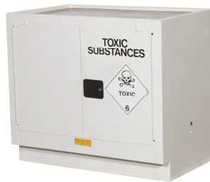
Storage Cabinet CAT.NO. AU25748T Capacity 100 Litre 2 Shelves