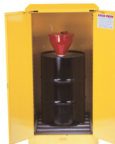
Vertical Drum Storage CAT.NO. AU25701 207Lt Capacity