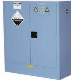
Storage Cabinet CAT.NO. AU25302B Capacity 160 Lt 2 Shelves 6 x 20 Litre Containers