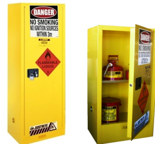
New Slim Line Storage Cabinets CAT.NO. AU25304 / AU25308 Capacity: 110 & 170 Litre