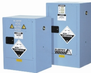
Storage Cabinet AU25712B - Capacity 60 Lt AU25714B - Capacity 30 Lt Single Door, 2 shelves