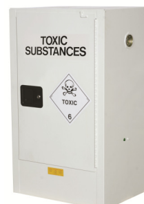
Storage Cabinet AU25712T Capacity 60 Lt AU25714T Capacity 30 Lt Single Door