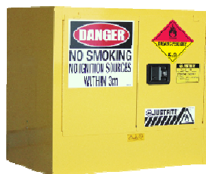
Storage Cabinet CAT.NO. AU25748OP Capacity 60 Litre 2 Shelves