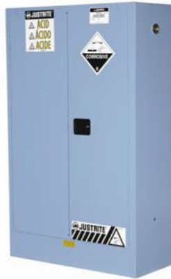
Storage Cabinet CAT.NO. AU25452B Capacity 250 Lt 3 Shelves 9 x 20 Litre Containers