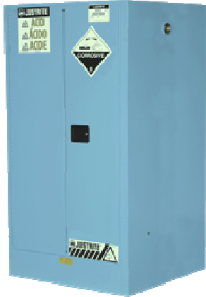
Storage Cabinet CAT.NO. AU25602B Capacity 350 Lt 3 Shelves 15 x 20 Litre Drums

These Cabinets are manufactured to comply with AS 3780 for the safe storage of Corrosive Substances.