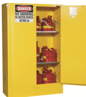
Safety Can Storage CAT.NO. AU25452 250Lt Capacity