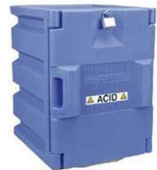
Polyethylene Storage Cabinet CAT.NO. AU24040 1 Shelf