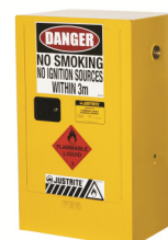
Safety Can Storage CAT.NO. AU25712 60Lt Capacity