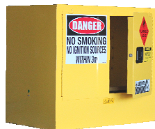
Under Bench Storage CAT.NO. AU25748 100Lt Capacity