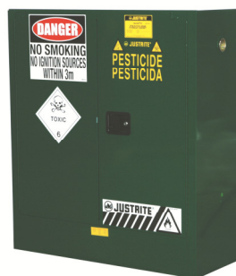
Storage Cabinet CAT.NO. AU25302P Capacity: 160 Litre 2 Shelves 6 x 20 Litre Containers