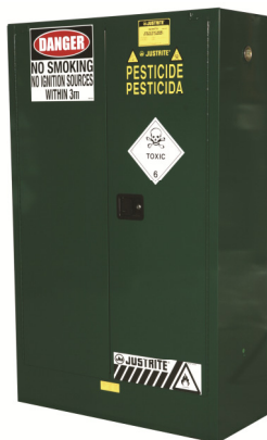
Storage Cabinet CAT.NO. AU25452P Capacity: 250 Litre 3 Shelves 9 x 20 Litre Containers