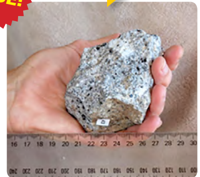
Indicative sample size.

The kit comes nicely boxed, one box for each rock type (igneous, metamorphic, sedimentary)